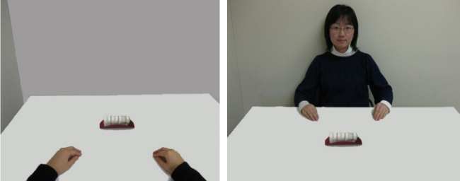
Figure 1: Internal versus external perspective images