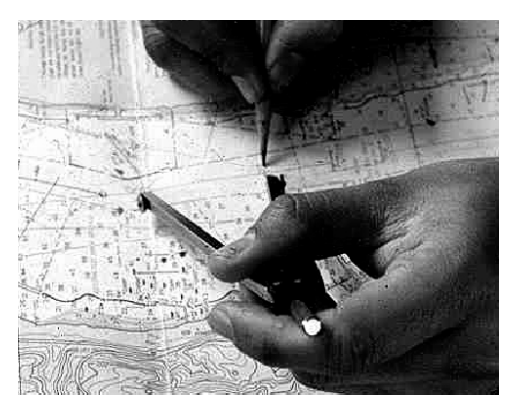
Figure 1 Using the dividers to span the distance between successive position fixes.

The navigator's first step is to see and apply the dividers to the span of space between the position fixes (figure 1). This is a visual activity, but also a motor activity. Techniques for the manual manipulation of the dividers require precise hand-eye coordination. As a consequence of decades of experience, skilled navigators acquire finely tuned habits of action and perception. These include sticking the point of one arm of the divider into the previous fix triangle on the chart, adjusting the spread of the dividers while