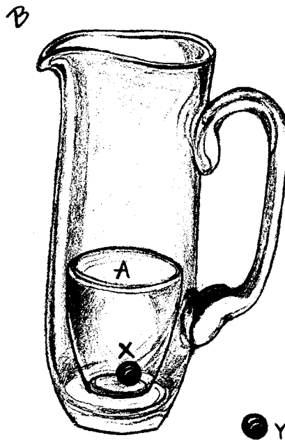
Figure 1. The “laws” of cognitive Container Schemas. The figure shows one cognitive Container Schema, A , occurring inside another, B . By inspection, one can see that if X is in A , then X is in B , and that if Y is outside of B , then Y is outside of A . We conceptualize physical containers in terms of cognitive containers. Cognitive Container Schemas are used not only in perception and imagination but also in conceptualization, as when we conceptualize bees as swarming in the garden. Container Schemas are the cognitive structures that allow us to make sense of familiar Venn diagrams.

Now, recall that conceptual metaphors allow the inferential structure of the source domain to be used to structure the target domain. So, the Classes Are Containers Metaphor maps the inferential laws given above for embodied Container Schemas (source domain) onto conceptual classes (target domain). These include both everyday classes and Boolean classes, which are metaphorical extensions of everyday classes. The entailment of such conceptual mapping is the following: